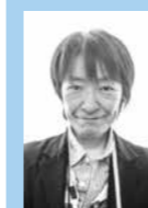
Director Toshie Awaya

The Center for the Study of Contemporary India at Tokyo University of Foreign Studies (FINDAS) aims to integrate literature studies with historical, political, and social analyses of social movements that have become increasingly multi-layered and diversified. Using gender perspective as the axis, we aim to deepen our understanding of structural changes in contemporary South Asia. How are people building social ties within social movements, and how have those social ties changed? How does literature reflect social movements? Exploring even emotion and affection, we will try to get to the heart of structural change in South Asia. To advance these purposes, we will take full advantage of our University's unique strengths. These include not only the teaching of various South Asian languages, such as Urdu, Hindi, and Bengali, but also our long tradition of South Asian area studies since the Meiji Period. We boast of one of the largest collections of books written in various South Asian languages in Japan, as well as documents and historical materials related to South Asia. While systematically enhancing these collections of documents and historical materials, we aim to become one of the national centers of South Asian Area Studies, with world-class research resources. In addition to organizing collaborative studies within our network of national and international researchers, we aim to strengthen South Asian area studies by nurturing young researchers.